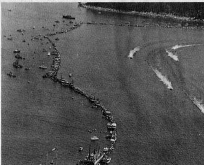
More than a thousand pleasure boats anchored at the two-mile-long log boom in Lake Washington for the Gold Cup races