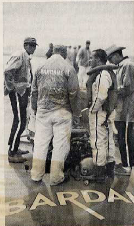
After a trial run, driver and crew chief discuss water conditions and performance. J