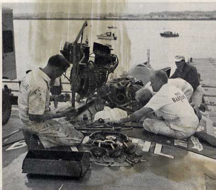
Her crew knows each part by feel and there is an air of confidence as they swarm over her for routine checks and double checks every time she comes in from a run.