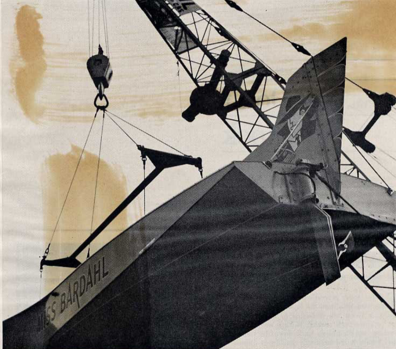
After each heat, the boat is gently lifted from the water and laid on her trailer bed with a frame specially designed to distribute