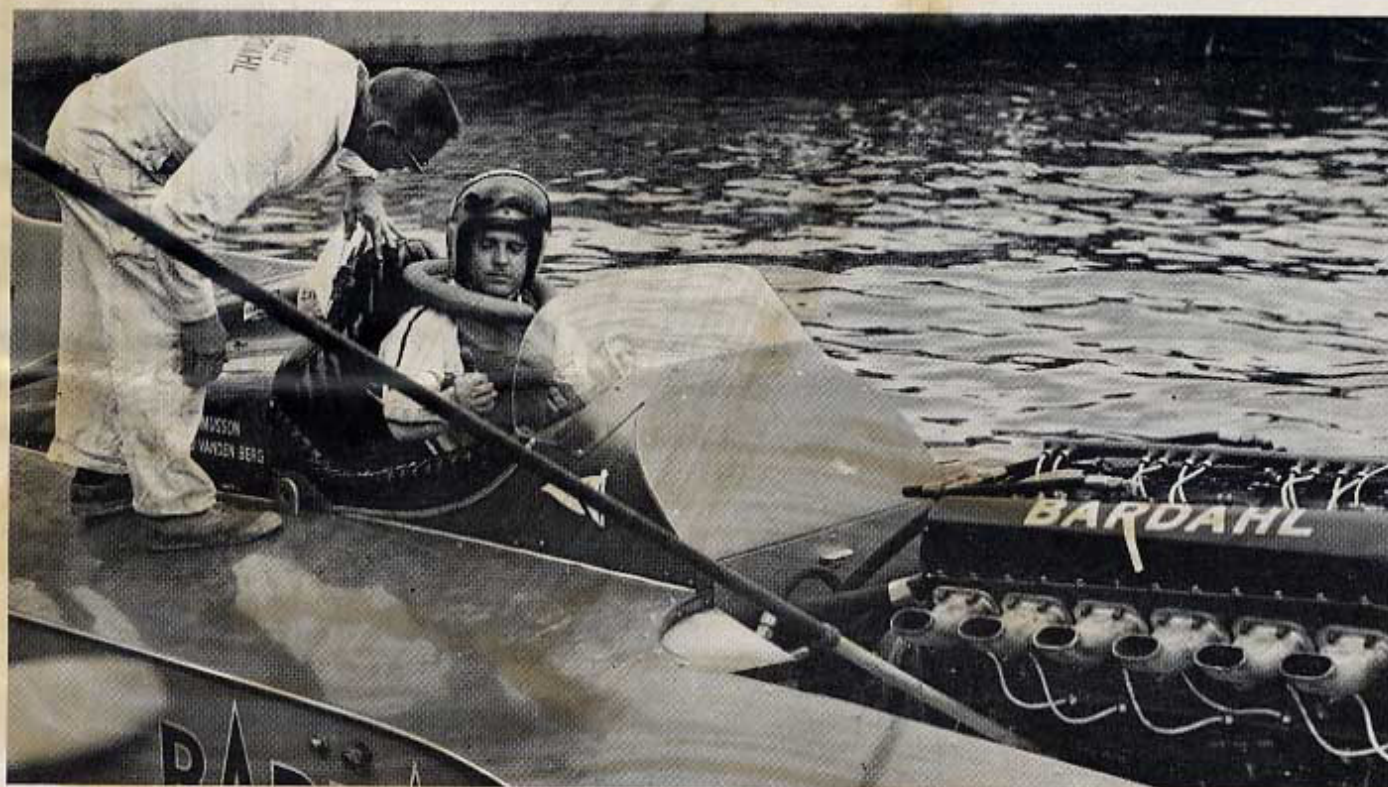
Final words before firing up for a heat at speeds close to 200 mph. If anything breaks, the crew can draw on a stock of two or

three extra engines, eight or ten props, and a full van of spare parts that accompany the boat when she is on the race circuit.