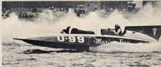
• The rich Lake Tahoe purse is sure to attract an unusually large field. Expected to be on hand are such colorful competitors as Gale V (at top), Miss Smirnoff (above left), Mariner Too (above right), and the 1964 defending champion, Miss Bardahl (below).